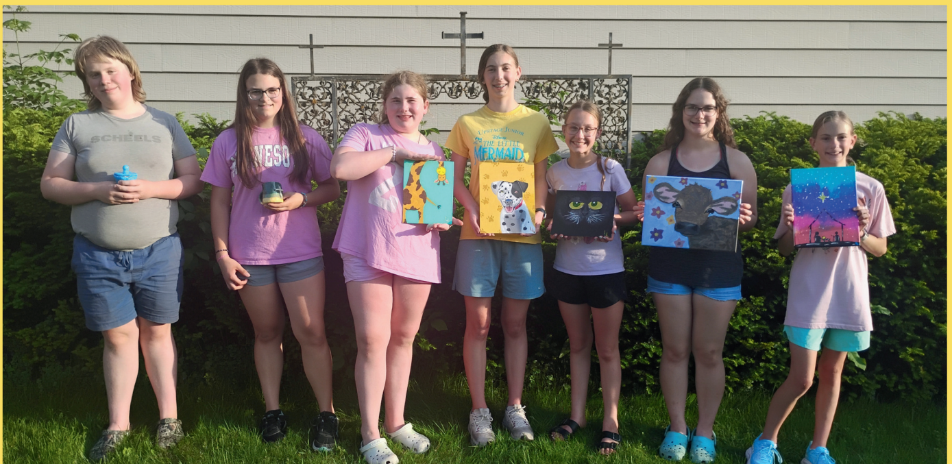
At EPIC on June 3, youths enjoyed an art show with each other as they shared their works of art with each other.