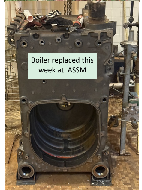
Boiler replaced this week at ASSM