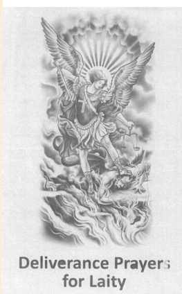
Deliverance Prayers for Laity

Handouts from GIFFT night available at parish office.