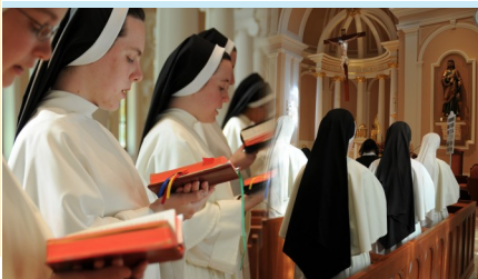
Sisters at Mass