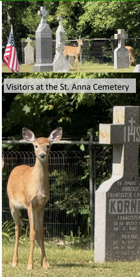
Visitors at the St. Anna Cemetery

The person who is trustworthy in very small matters is also trustworthy in great ones; and the person who is dishonest in very small matters is also dishonest in great ones. If, therefore, you are not trustworthy with dishonest wealth, who will trust you with true wealth? Lk 16:10-11