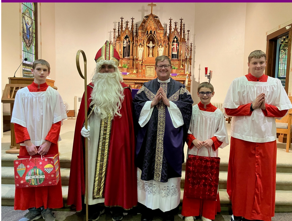
St Nicholas made his appearance Sunday, Dec. 8th at All Saints-St. Mary's