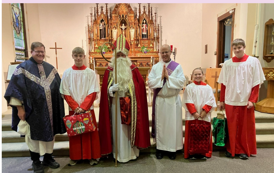
St. Nick visited All Saints-St. Mary's

All parishioner families are encouraged to take home a 2024 calendar (one per household). These beautifully symbolic calendars are a gift to you from our parish to assist you in living the liturgical seasons and feast days in the new year.