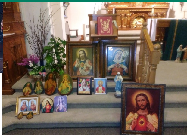
Enthronement of the Sacred Heart

Contact Shelley Vouk with questions 248-2860.