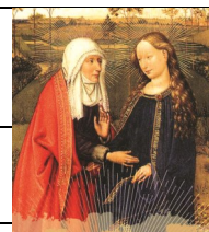
THE VISITATION "WHO AM I, THAT THE MOTHER OF MY LORD SHOULD COME TO ME?"