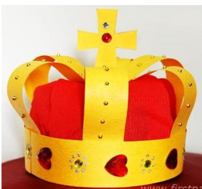
Craft a Crown for the Epiphany