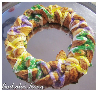
Celebrate with a King cake