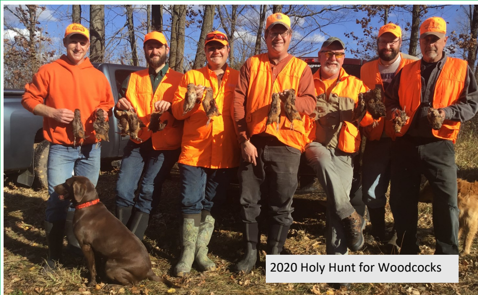
2020 Holy Hunt for Woodcocks