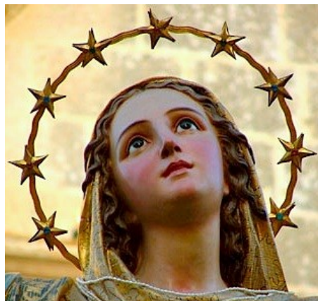
The Queen of Heaven