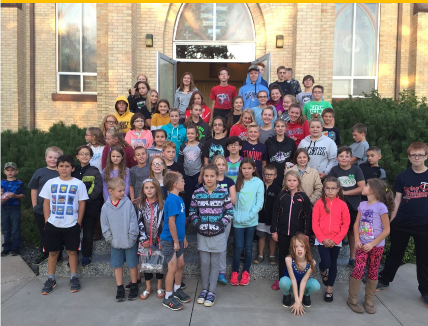
Immaculate Conception Faith Formation

Prolife Pizza and Bowling Join in for a fun event with friends Friday, October 18th from 8:00 a.m. to 2:00 p.m. Youth 7th-12th grade.