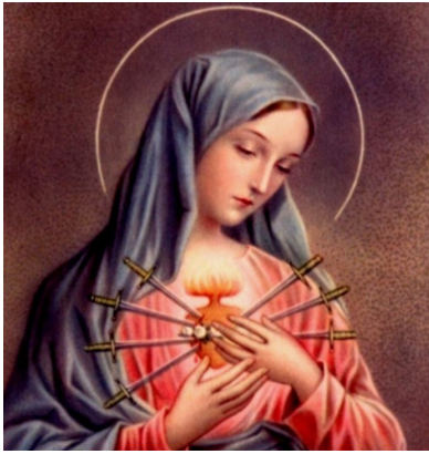
Feast of Our Lady of the Seven Sorrows September 15th!