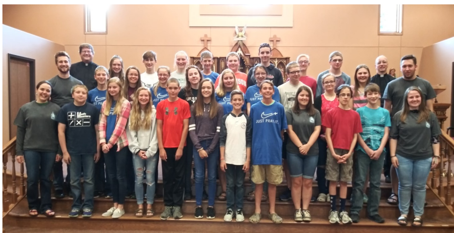
Totus Tuus 7th-12th grade 2019 Thank you for all who made this possible.